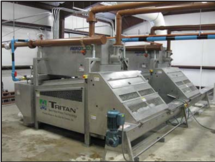
The TRITAN dewatering belt press provides three belt performance with single belt tracking.

The TRITAN is a cost effective solution that combines a sludge pre-thickener with a belt press in one unit. This streamline design eliminates the need for two separate pieces of equipment, reducing the equipment footprint. Simplicity is the TRITAN . This operator friendly belt press offers three belt performance providing excellent dewatering and a dry cake comparable to traditional equipment, but with less moving parts. The seamless belt, together with the drive belt, provides a high performance belt