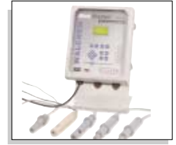
WEBMASTER GENERAL INDUSTRIAL CONTROLLER

All pumps include a manual air vent valve with the exception of FC liquid ends. All pumps include one foot valve, one injection valve, 20 feet of polyethylene tubing and one ceramic weight.