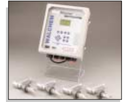
WEBMASTER COOLING TOWER/BOILER CONTROLLER