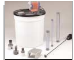
METERING PUMP AND ACCESSORIES