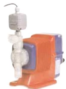
EW with Posiflow

Easy Draw-Down Calibration - In the calibration mode the user only needs to start and stop the pump, enter the draw-down volume and the pump calibrates volume-per-stroke.