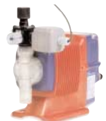
EW with Multifunction Valve & Posiflow

2-Year Warranty "Bumper-to-Bumper" On All E-Class Pumps - Including Worned Parts