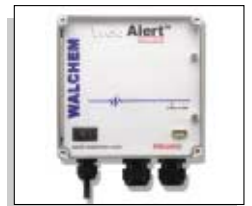
WEBALERT REMOTE MONITORING & DATALOGGING

Walchem designs and manufactures an integrated line of analytical control, sensing and metering equipment.