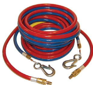
22' Interconnect Hose