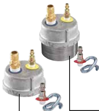
Hi-Flow™ Line Acceptance Conversion Kit Cap Version 3/4" Test Pressure quick connect