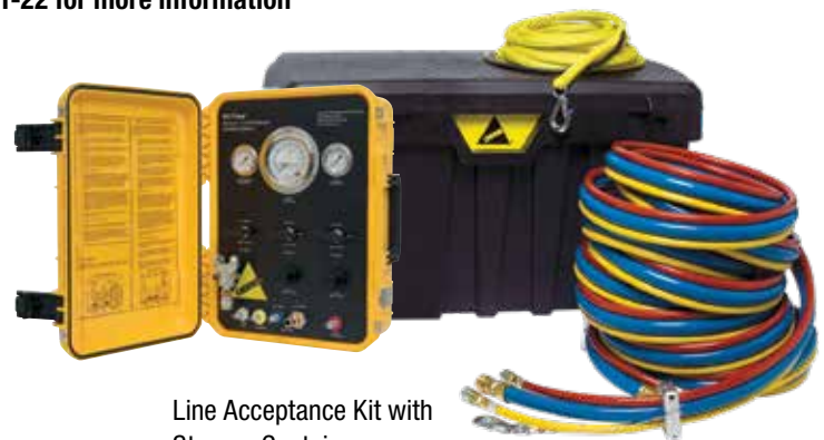
Line Acceptance Kit with Storage Container