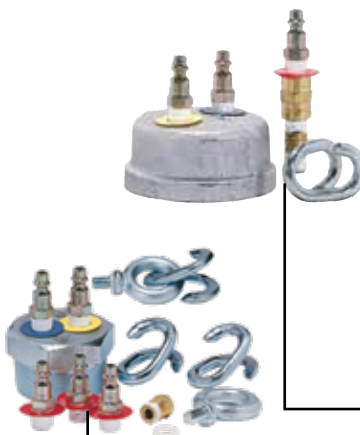
Leak Location Conversion Kit Plug Version 3/8" Leak Location quick connect